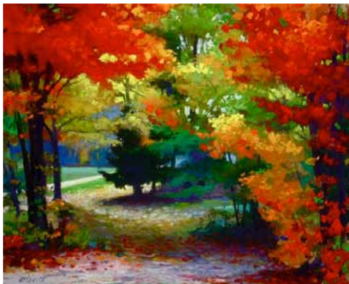
"Once upon a fall day," pastel by Larry Blovits