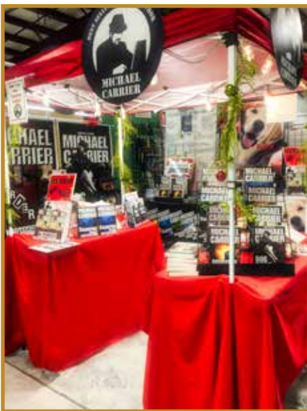
Evie and Michael's booth

Year after year there has always been a seamless, well-organized team of GVA volunteers, ready and willing to deploy an endless supply of smiles. They show us where to unload, how to park and what to expect. Without fail we have thusly been welcomed into the East Grand Rapids neighborhood. When the day begins, it is always a joy to greet new and previous buyers. They are also thrilled to find out what is new and to enjoy the adventure of making new friendships.